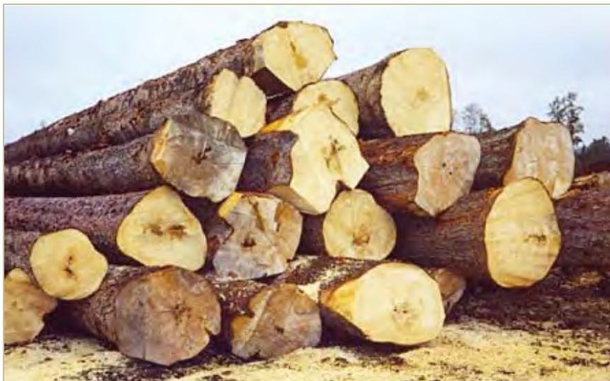
White spruce logs