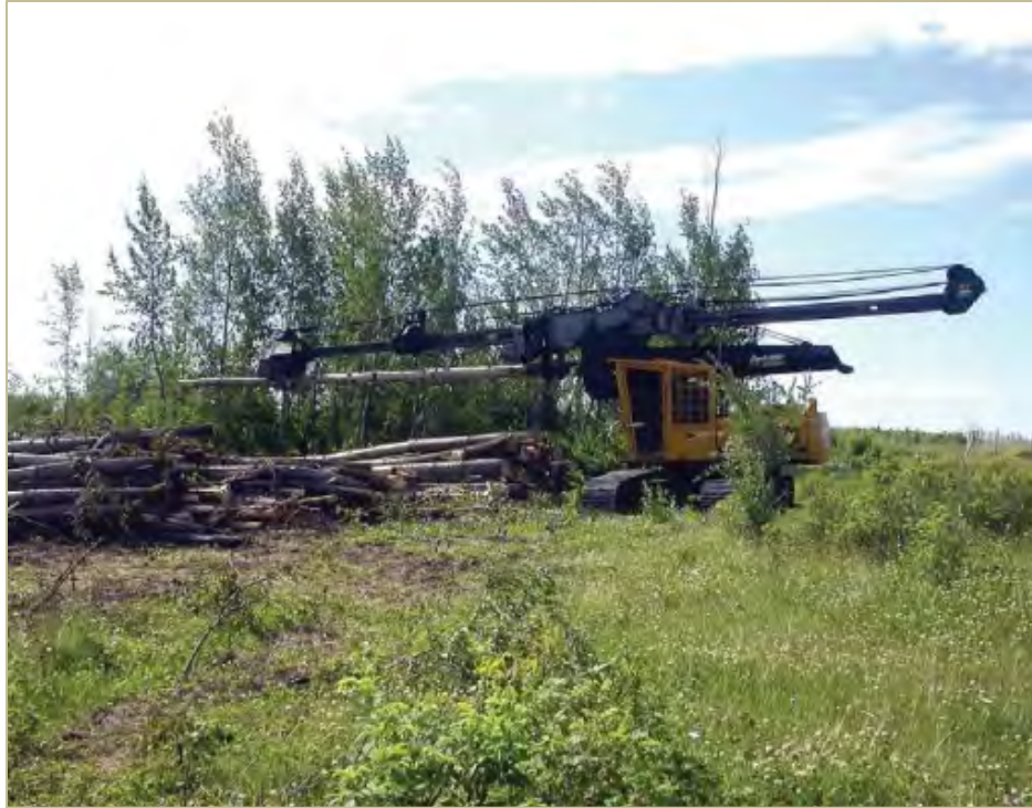
Tree delimiting