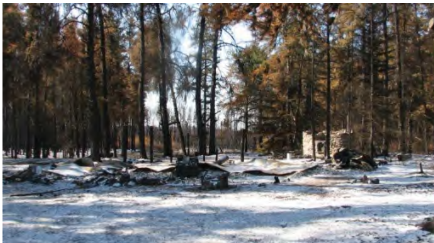
Burnt house and forest area