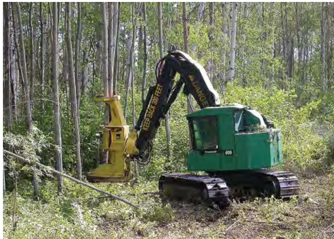
Tree harvesting

Harvesting timber is a costly but important woodlot activity. Although realizing a financial return is a major reason to harvest timber, changing species composition, removing damaged or diseased trees, or improving the quality and future value of the stand are also legitimate reasons for harvesting. Whatever the reason, the operation should be planned carefully to optimize the yield and to accommodate numerous