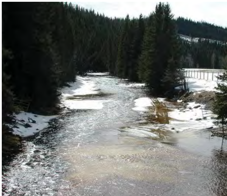
Creek and buffer